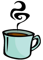
Exhibit and Advertising

Food and drink are NOT permitted in the church, except in the Coffee Shoppe. Water is allowed in a sealed container. Friday and Saturday lunch orders will not be available this year. Enjoy a meal offsite with your friends!